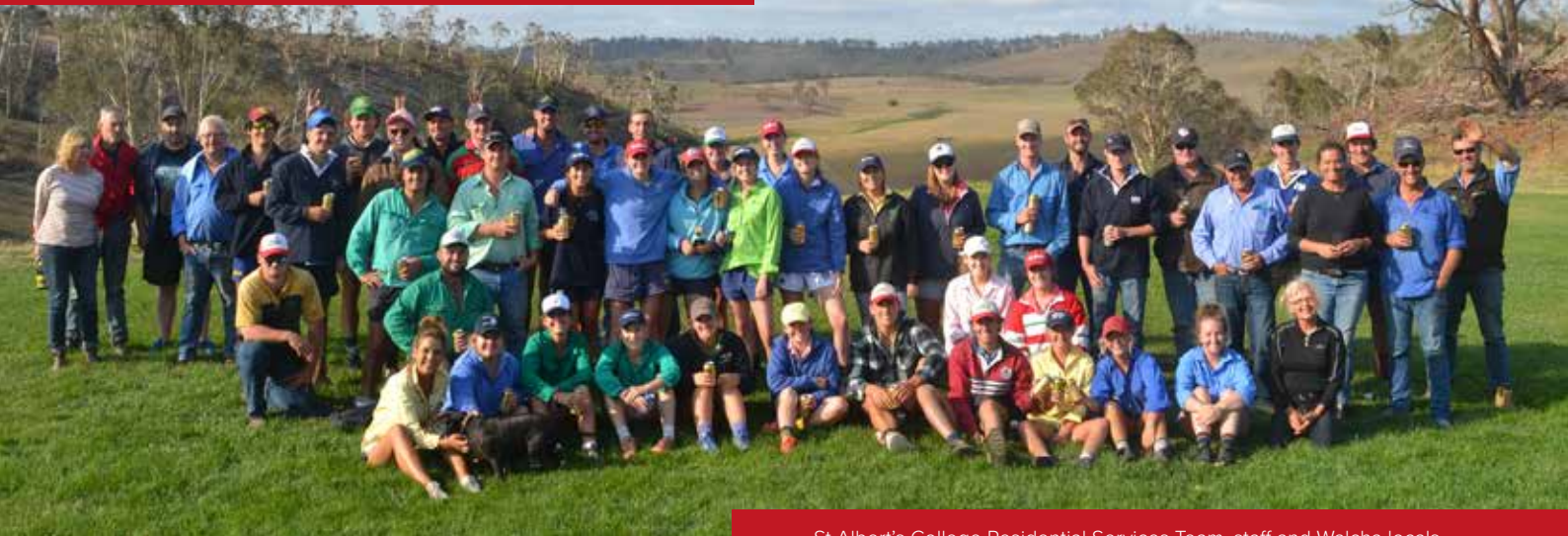
St Albert's College Residential Services Team, staff and Walcha locals.

P rior to Christmas a storm described as 'the worst storm in living memory' for the Walcha community devastated the properties of landholders in the region. In February our student leaders travelled to Walcha to assist the affected landholders in an effort to clean and clear the properties of the debris from the storm.