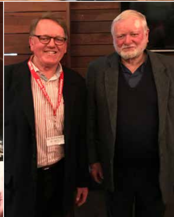
Once you're Albies, you're Albies for life, some happy snaps from our Alumni events in Brisbane, Canberra and Melbourne over 2019. #AlbiesForLife