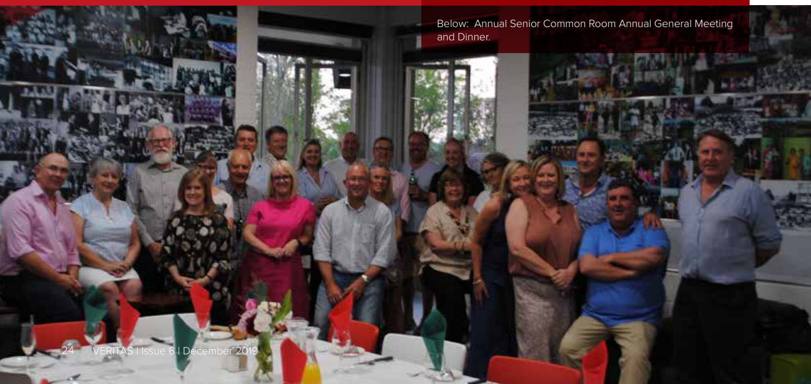
Below: Annual Senior Common Room Annual General Meeting and Dinner.

"Big anniversaries (50th's) don't come along that often and to be part of a great celebration was an enormous amount of fun and one that all the Senior Common Room (SCR) will never forget."