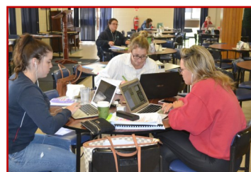
Students studying hard this week in the Dining Hall